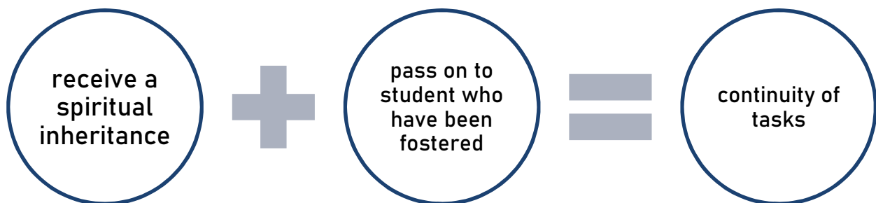
Figure 2. The Biblical Model of Leadership Succession