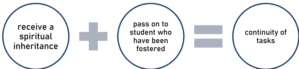
Figure 2. The Biblical Model of Leadership Succession