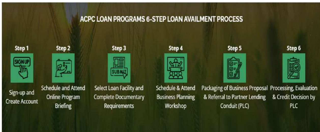
Figure 4. ACPC Loan Availment Process

The other conduit bank was located in Pampanga that due to its distance, the committee decided that it is more practical to focus in pursuing the last remaining rural bank identified as conduit by ACPC that was located in Nueva Ecija thereby, NRBSL and PCC started assisting dairy carabao farmers since May 2021 to present. During the first four (4) months of orienting and assisting carabao farmer loan applicants the old process of loan application from ACPC (Figure 4) was implemented. The old process, which has six (6) steps, requires individual farmers to sign up and create their own accounts with the ACPC website which was proven to be difficult for ordinary farmers due to their lack of education, low technology adoption, low self-esteem and slow internet connection. For an ordinary farmer to formally apply for his/her desired loan, it would demand time and money which most of them do not have especially if they would still undergo a stringent process that doesn’t provide assurance if they will be qualified for the loan