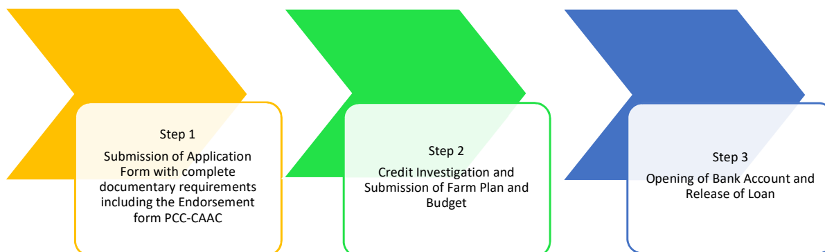
Figure 5. New Process Piloted for Availment ANYO Loan

After one (1) week, NRBSL employees conduct house-to-house Credit Investigation (CI) to assess the capability of the loan applicant to pay and ensure that the proposed loan will be spent