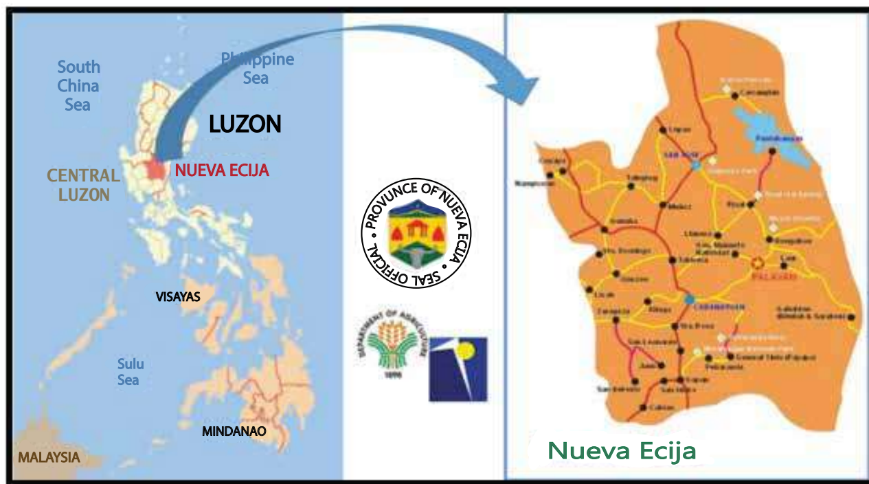
Figure 2. Map of Nueva Ecija

namely the first, second, third and fourth districts are the representations of the Province of Nueva Ecija in the Philippine House of Representatives. The Local Government Code, also known as Republic Act No. 7160, defines agricultural land as land devoted principally to the planting of trees, raising of crops, livestock and poultry, dairying, salt making, inland fishing and similar aquacultural activities and other agricultural activities, commercial or industrial.